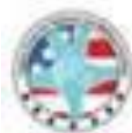
Legacy Corps for ... @c · 11h ...

Replying to @AmeriCorpsCEO @MayorGallego and @ASULodestar